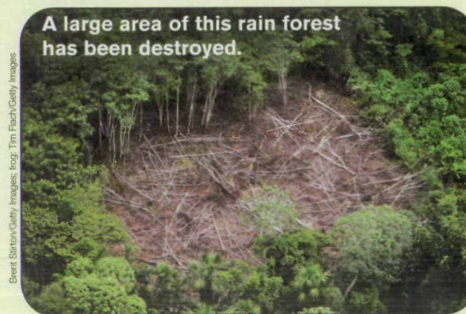
A large area of this rain forest has been destroyed.

Brent Stirton/Getty Images; frog: Tim Flach/Getty Images